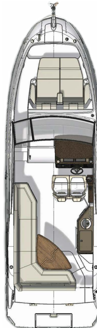
DECK / COCKPIT