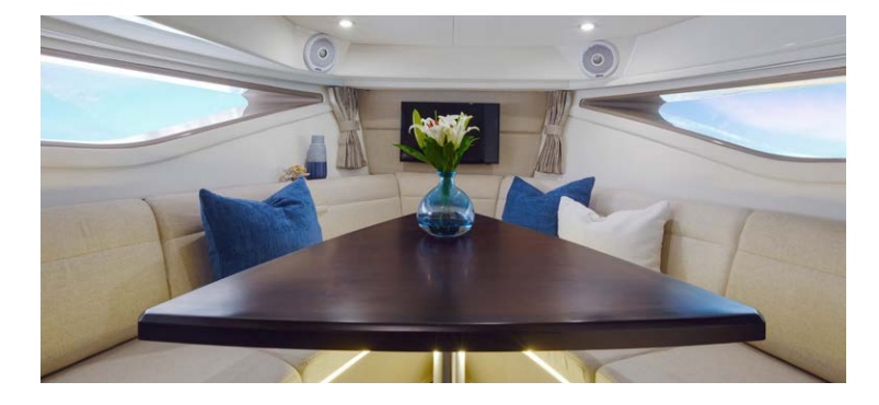
In the forward Salon / V-berth, a stylish table converts via filler cushion to form a comfortable full-sized bed. A deluxe head, gourmet-ready galley with extending countertops, flatscreen TV and generous storage round out this inviting space.